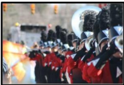
In the NW Community!