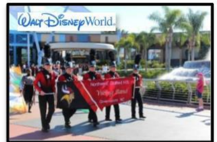
At Walt Disney World!