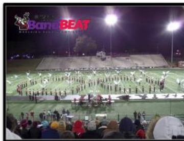
Competing in SC!