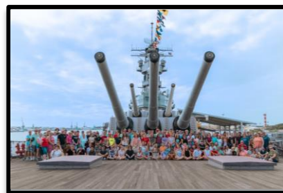
Pearl Harbor 80 th Anniversary!