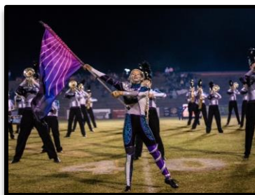
Games & Competitions!