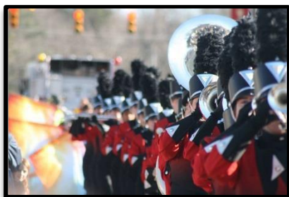
Stokesdale Christmas Parade!